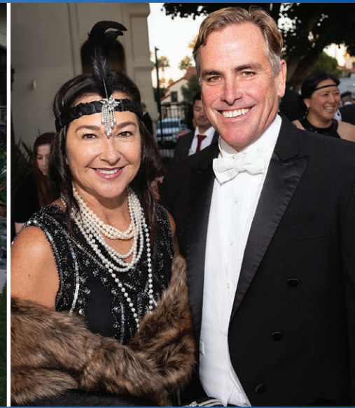
Celebrating the 51st Benefactors' Ball Shhh... It's a Speakeasy!