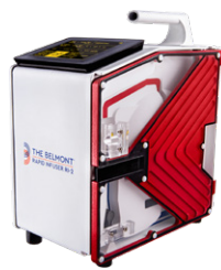
Belmont Rapid Infuser