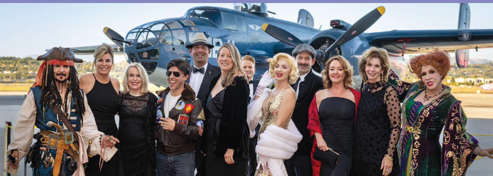
50th Benefactors' Ball — A Red Carpet Affair