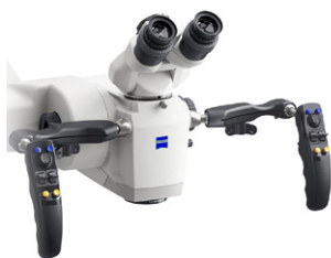
Zeiss Kinevo 900®